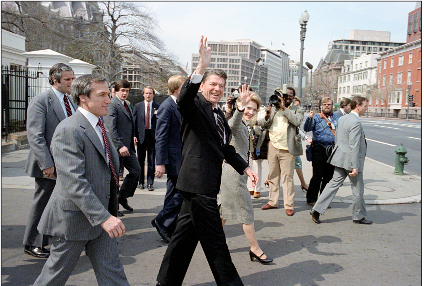
President Reagan and Nancy Reagan on the morning of the assassination attempt. March 30, 1981.

CCSS.SL.6.4 Present claims and findings, sequencing ideas logically and using pertinent descriptions, facts, and details to accentuate main ideas or themes; use appropriate eye contact, adequate volume, and clear pronunciation.