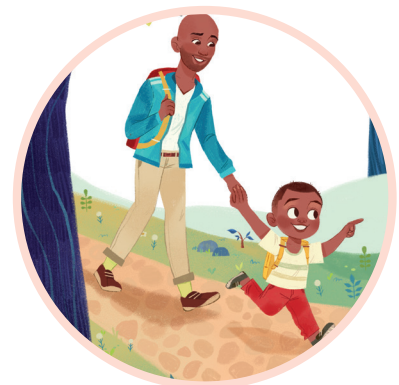
Go for walks