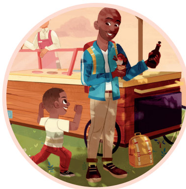
Get ice cream